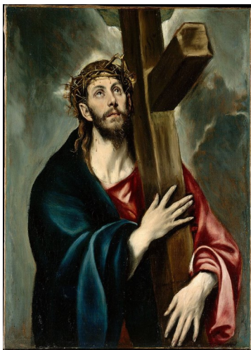
Christ Carrying the Cross El Greco (1541-1614)